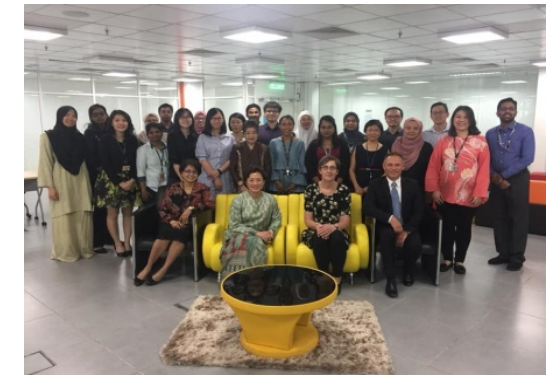
Visit by Tuning Program Coordinators