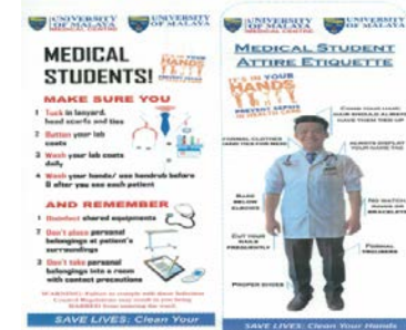
Practices in Patient Safety in Medical Training